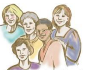
Women of the Church